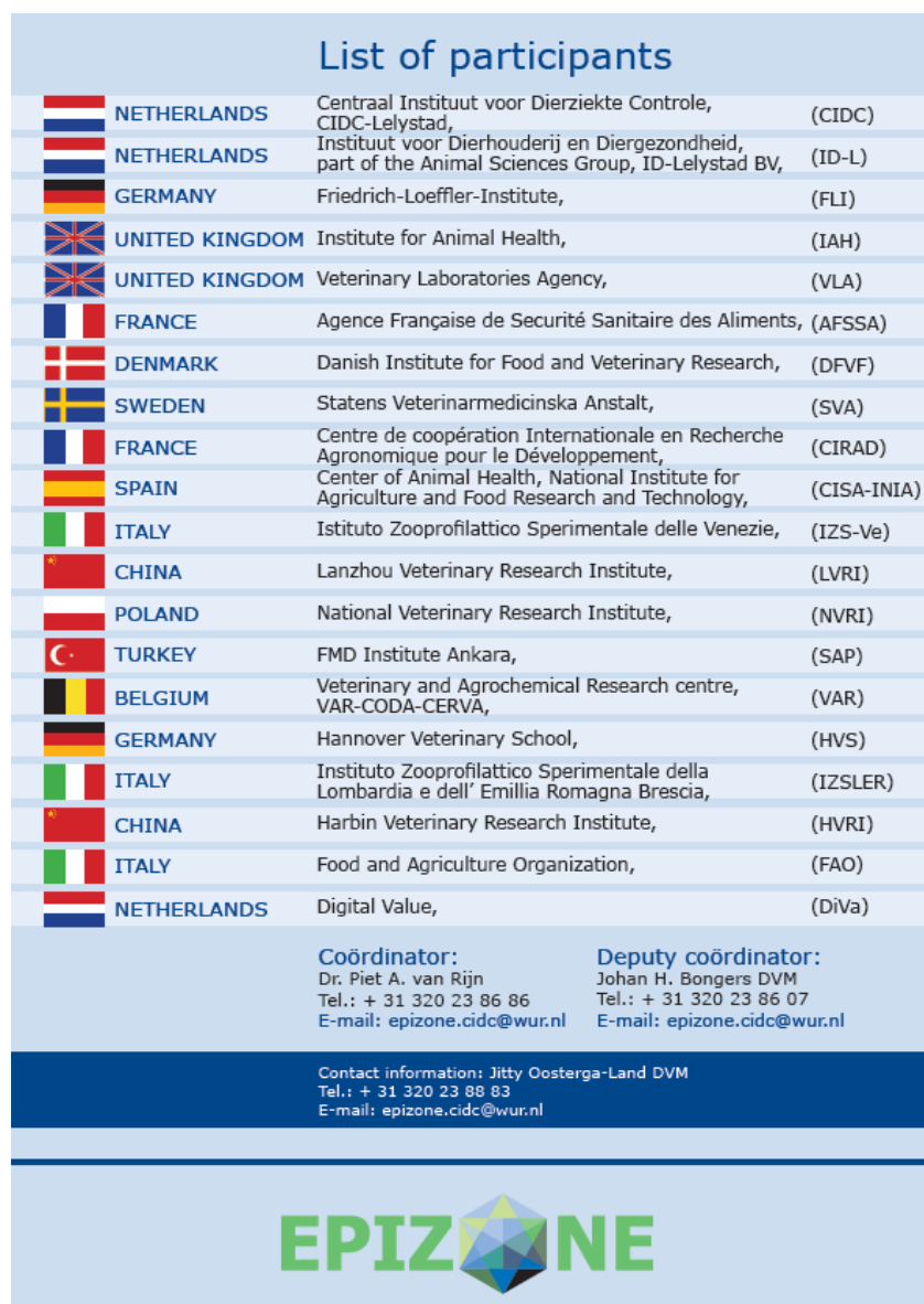
Figure 1 Involved contractors and coordinator contact details